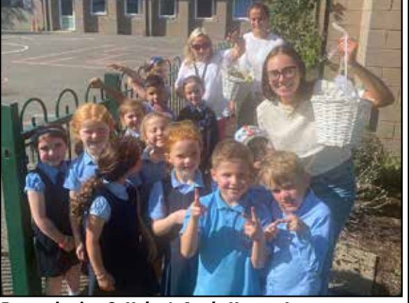
Fun gathering St Helen's Apple Harvest!