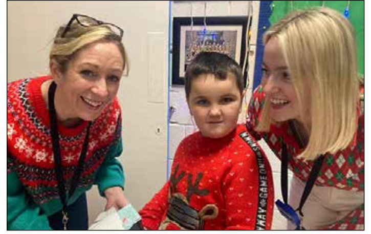
Happy with Santa's visit