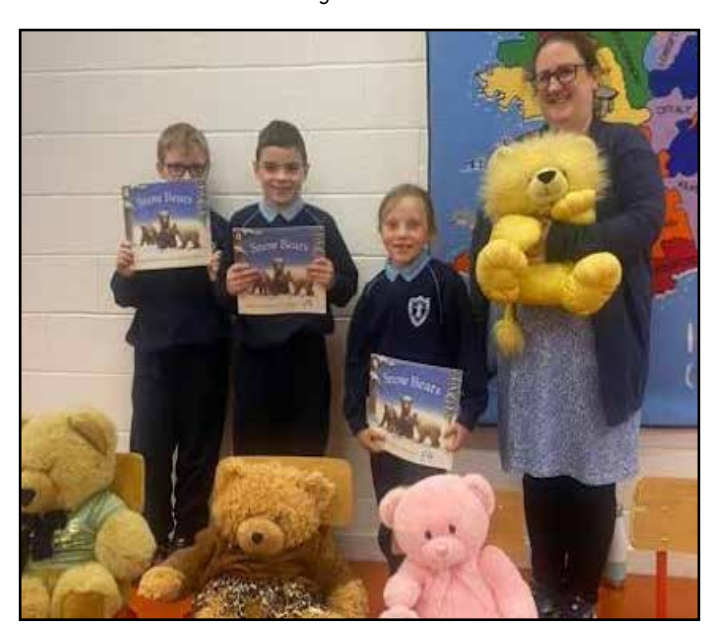
Storytelling - Snow Bears at Winter Assembly