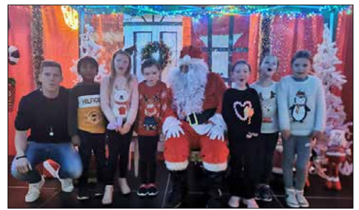
Naughty or nice