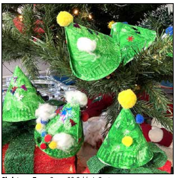
Christmas Trees Room 23 Cabhair Centre