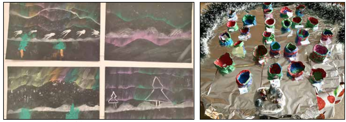
Northern Lights Ms Ahern 2nd class