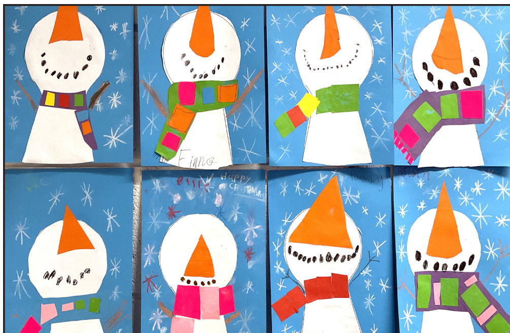
Room 21 - Snowmen