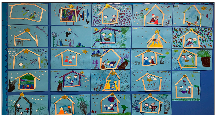
Room 20 - Cribs