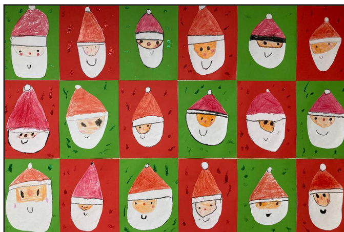
Room 15 - Santa