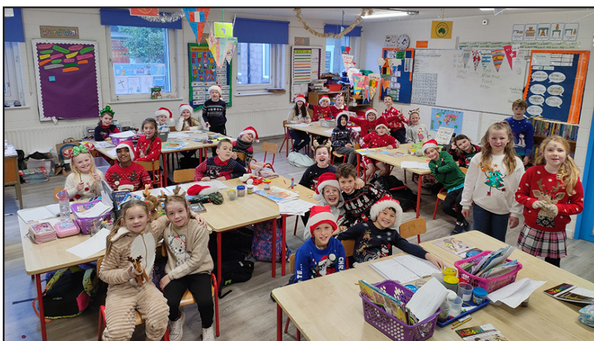
Room 6 - Christmas