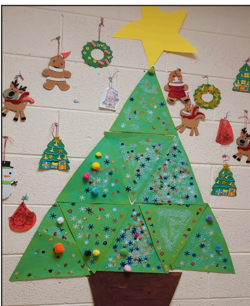
Room 25 - Christmas Tree