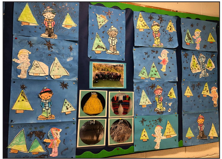
Room 17 - Winter Wonderland