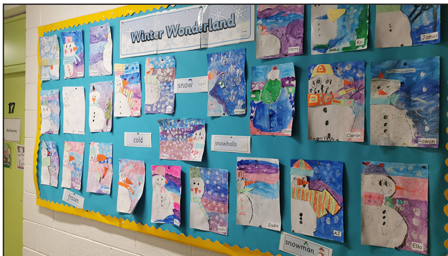
Room 18 - Winter Wonderland

https://greenschoolsireland.org/themes/global-citizenship-energy/