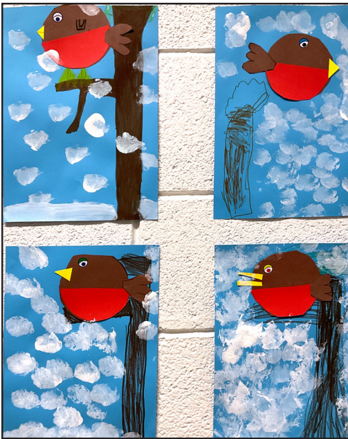
Room 16 - Snowmen