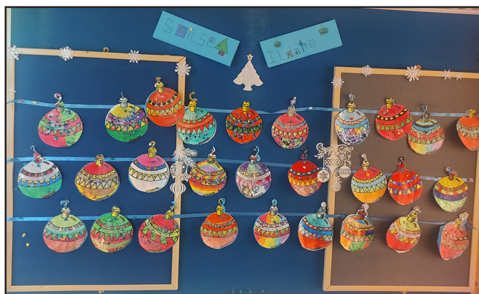
Room 13 - Baubles