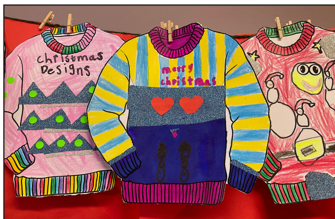
Room 12 - Christmas Jumpers

Our Shared Reading Programme has also restarted this year. The transition years from Portmarnock Community School visit one of our Senior Infants every Wednesday. Each transition year student sits individually with a Senior Infant child and reads with them in our school hall. They discuss the books they have read and write or draw about the characters. The Transition years and Senior Infants really enjoy this time.